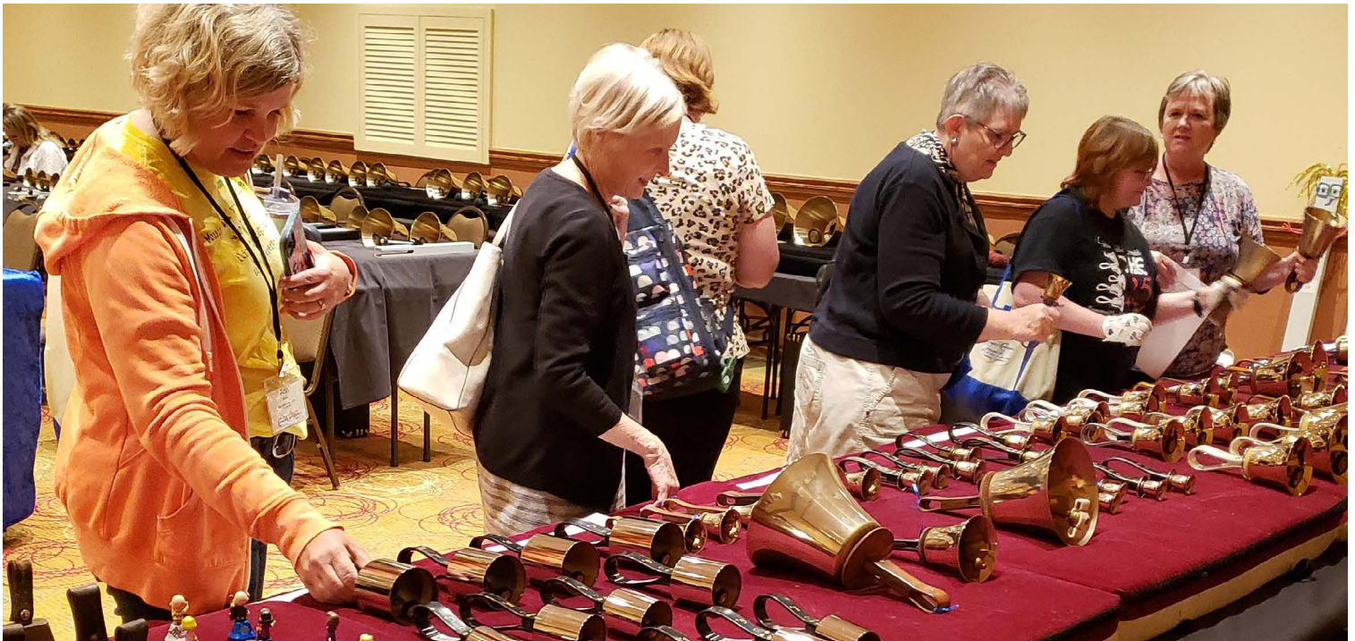
Attendees at the 2024 Area 8 Festival "petting" a variety of bells on display

I hope you'll be as excited to see and hear these bells as I am! Get ready to GEEK OUT at the Handbell Petting Zoo at the Area 8 Festival in La Vista, Nebraska.