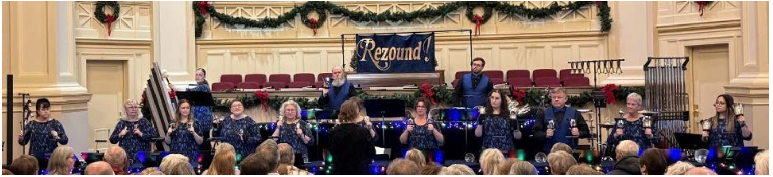
Rezound! performs at First Christian Church, December 2025.

Rezound!'s mission also includes education and outreach, which has taken a variety of forms over the years. It has participated in numerous local, regional, and national festivals and conferences during its history, and members have served as clinicians at these events. For several years, Rezound! hosted the Show Me Ring (a skill building workshop) and Resonate (an advanced ringer program) to reach out to all aspects of the handbell community in the region. More recently the group has hosted sight-reading workshops and in 2026 will launch its newest short-term ensemble for intermediate-advanced ringers, called echo!. After its concerts, Rezound! invites audience members to come and see the bells and speak to the ringers to ask questions or try ringing for themselves. Outreach has also included visiting schools to do handbell ringing demonstrations and to allow students to participate.