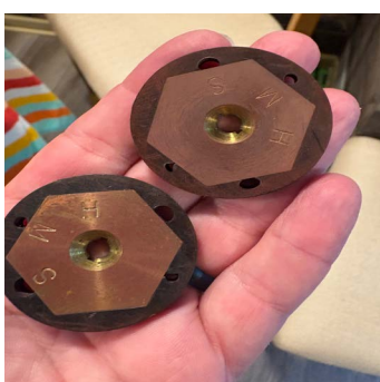
Old clappers heads