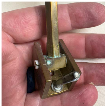
Oxidation around the clapper arm of a Schulmerich assembly