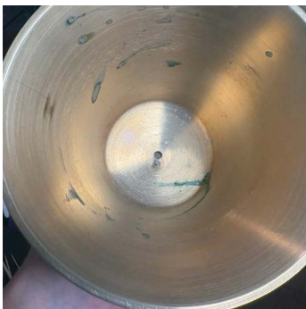
Sweat marks in a casting

https://schulmerichbells.com/pages/maintenance-videos