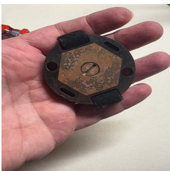
Dirty clapper head