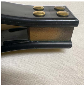
Oxidation on a Schulmerich handle