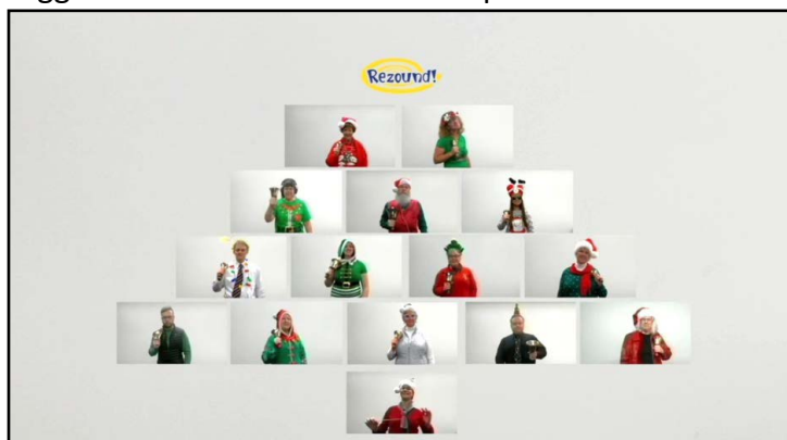
In 2020, Rezound! did its own version of a certain famous chocolate commercial. Link: Happy Holidays from Rezound!

Things seemed to be going very well for the group as 2020 began. The artistic director, who for 19 years had been an unpaid volunteer, was finally paid a small stipend. The group was already making plans for celebrating its 20th anniversary in 2021. A tour to Colorado was anticipated in 2020, and an even bigger tour to the East Coast was planned in 2021.