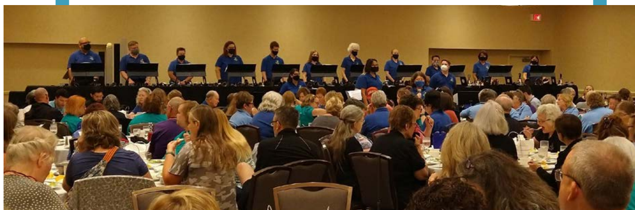
Lawrence Community Handbell Choir: Wow! Just wow!