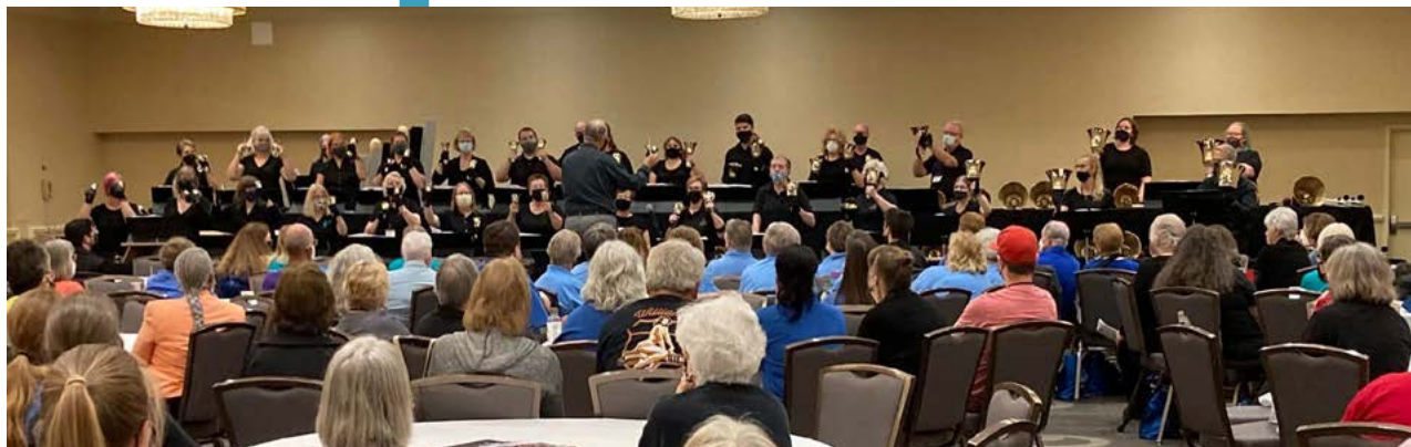
BronzeFest: The best of the best! Delightful