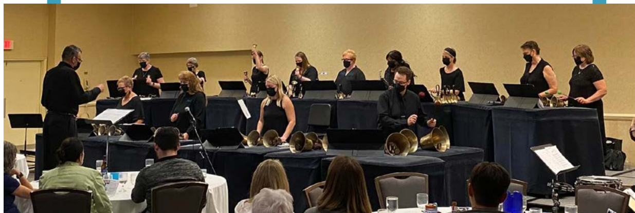
Columbia Handbell Ensemble: Fun, entertaining, excellent