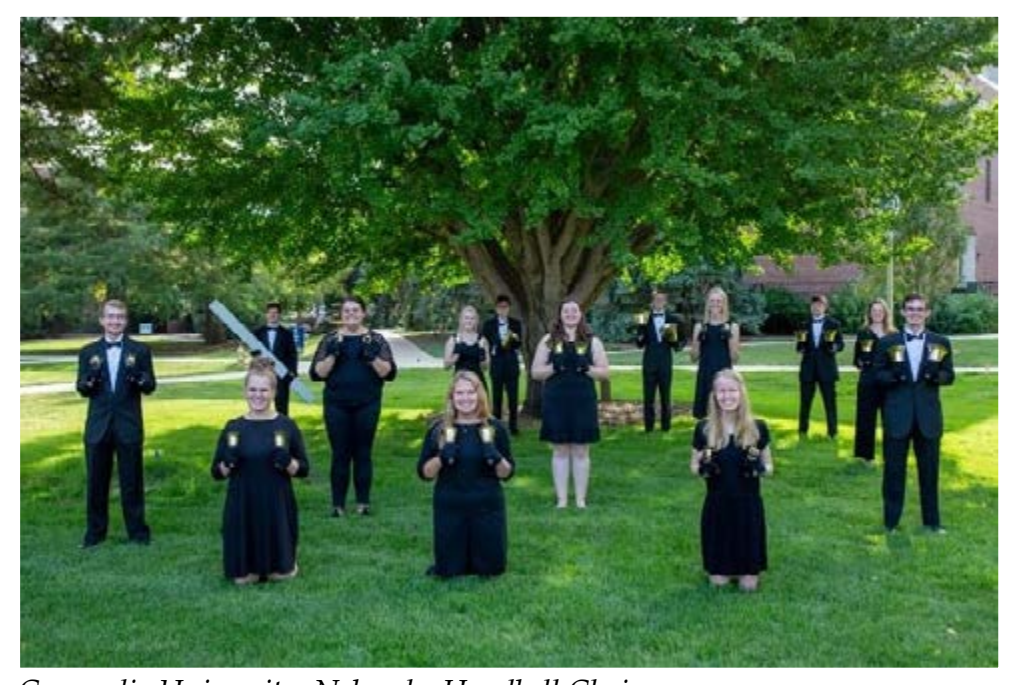
Concordia University, Nebraska Handbell Choir

COVID protocols for rehearsals are the new normal. Sanitize your hands on the way in and out, masks required at all times, assigned positions, gloves washed and returned to the same ringer, sanitizing equipment after rehearsals....If you have been ringing, you know these steps well! Even with extra precautions, we were so thankful to make music as a handbell choir once again this Fall Semester! One habit I will keep after COVID is giving each position an equipment bucket. The students have their complete set of necessary mallets, dowels, pencils, and polishing cloths in a bucket with their position number. At the beginning of rehearsal, they get their folder and bucket and instantly have what they need (in addition to bells, of course)! It is very efficient!